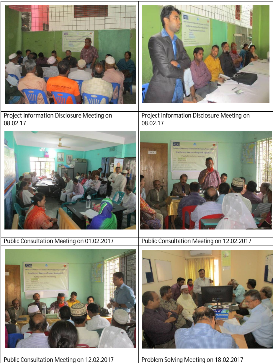
Photo Gallery on Activities at DMA – 605 for Resettlement Plan Preparation Procedure